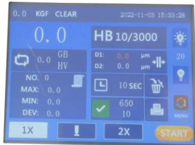
High Quality Color Touch Screen