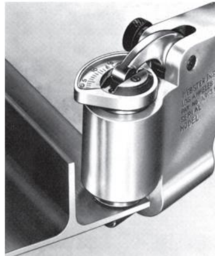
HARDNESS CONVERSION FOR ALUMINUM ALLOYS MODEL B