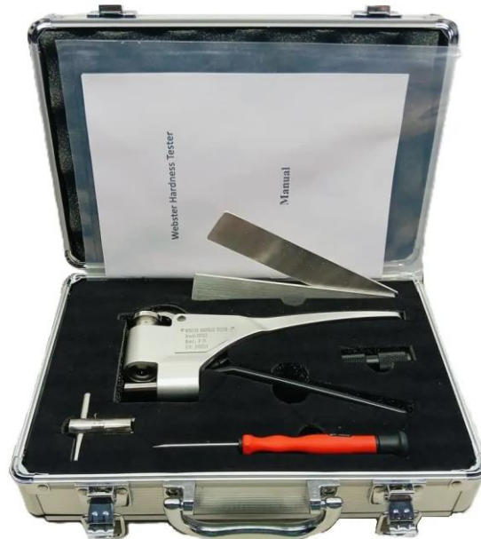
Webster & Barcol hardness conversion table

Spare indenter, standard hardness block, spare dial glass